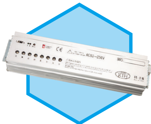
H-18 CONTROLLER WITH CTB DEVICE