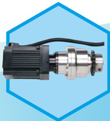
DC24V 180W MOTOR WITH PLANETARY GEAR